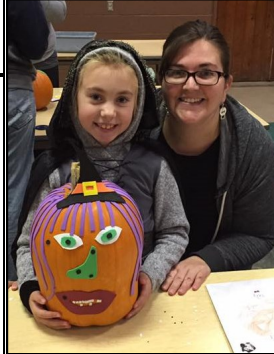
Halloween Family Fun Oct. 30, 2016

We are excited to introduce FAMILY GETAWAY WEEKENDS . Enjoy a relaxing weekend with your family and let us take care of the lodging, meals, and program! Family Getaway Weekends will start on Friday evening and finish after brunch on Sunday. Each family will stay in a cabin (4 bottom bunks, 2 top bunks, and a full bathroom). Meals will be provided in the Dining Hall. There will be some scheduled activities and programming but there will mostly be time for families to relax, enjoy each other's company, and have FUN together! Campfires, hiking, crafts, games & activities, relax with a book in a rocking chair, nature activities, horseback riding, high ropes course, canoeing, board games by the fireplace, worship..... time to getaway with your family and RELAX in God's beautiful creation! We hope to see you soon at a FAMILY GETAWAY WEEKEND!