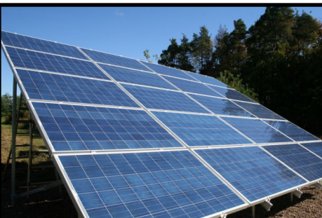
New Solar Panels at Terra Dei