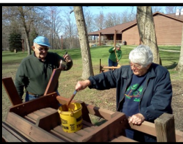
Spring Work Day