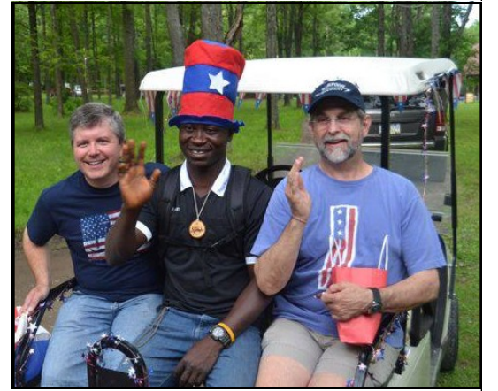
The Family Camp 4th of July Parade!