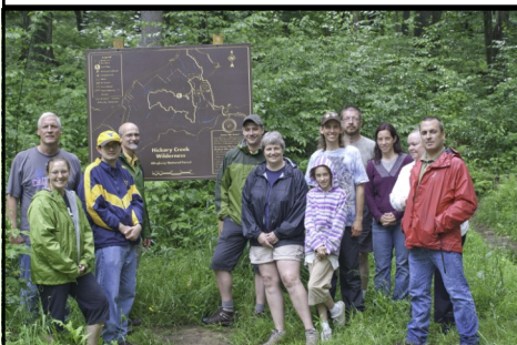
2012 EcoTheology Class