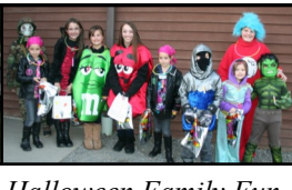
Halloween Family Fun